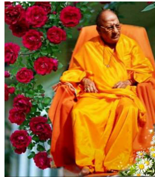
Guruji with you and within you